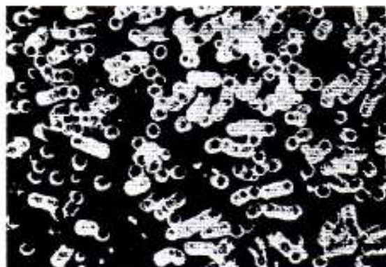
Figure 1. Example of red blood cell aggregation and rouleaux formation six hours after a high fat meal.

Figure 2) become stuck together and clumped into rolls, much like the rolls of coins one gets at the bank, see Figure 1. These rolls are called rouleaux. The photomicrograph shows that a large proportion of red blood corpuscles are still forming rouleaux six hours after a high fat meal. When they are glued together, blood cells have a much reduced total surface area, thus can carry much less oxygen. Furthermore, these rouleaux are too large and inflexible to travel through the tiny capillaries (hair vessels) and